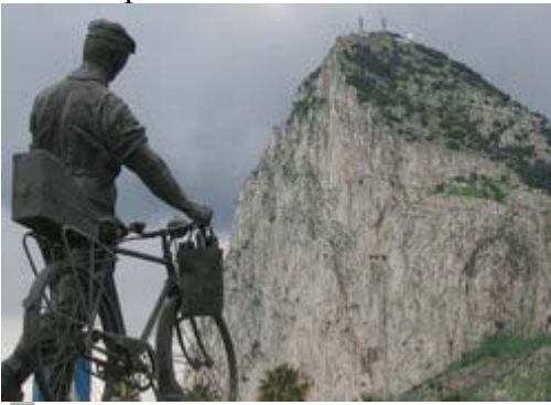
The Rock of Gibraltar as seen from ground level, 2003